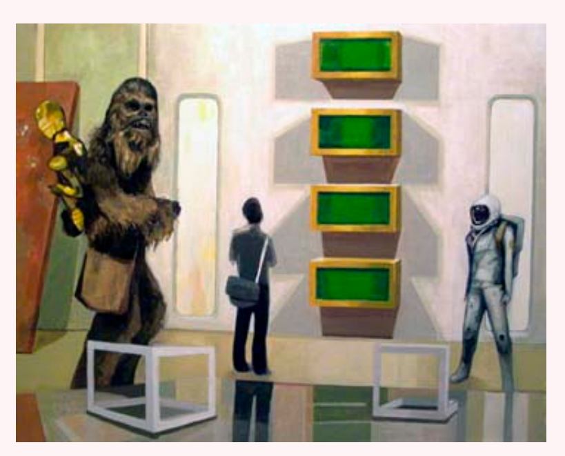
Scott Listfield, Chewbacca in cloud city with art, oil on canvas, 2003